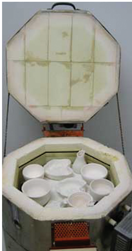
These instructions refer to the use of our DynaTrol control "Easy-Fire" programs. If you have a manual kiln you will need to adjust the switches to achieve various cycles.

This is a generic name for the 20 or so changes quartz goes through as the temperature increases and the molecules/particles/atoms become increasingly mobile. Most phases that a particle of quartz goes through as the kiln is heating will reverse during cooling. One of the largest and quickest changes the quartz goes through is roughly at 1,060°F with about a 2% increase in the size of the particles during heating. The process is reversed during cooling. Also, during cooling another 2% contraction takes place at about 439°F. This is caused by the formation of "cristobalite" in some clay bodies. There is a lot of other